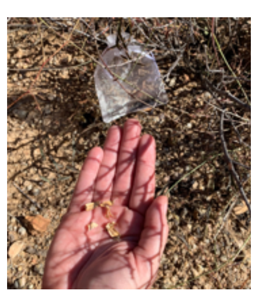
A seed collection strategy is to attach small mesh bags to immature seed pods so, as they mature, seeds are captured rather than be carried away by the wind or small mammals. MCC

Posted Tuesday, January 25, 2022 11:24 am